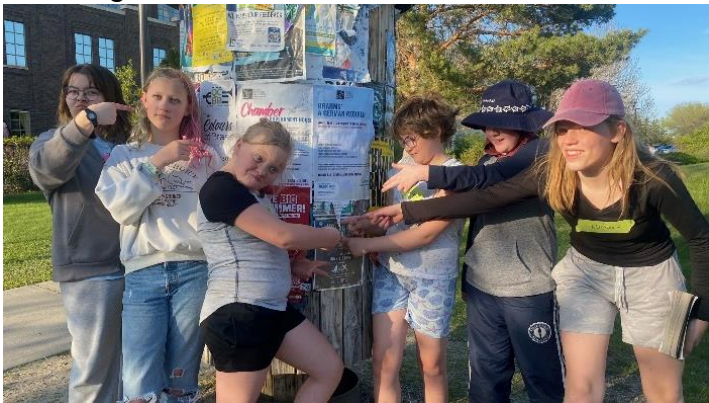
*Children finding scavenger hunt item*

Immanuel's youth group got together with Christ Lutheran and Our Saviors Lutheran to finish up the season with a scavenger hunt at Candy Cane Park, and of course, snacks! There were about 25 youth in attendance, and everyone, including the helpers, had a great time!